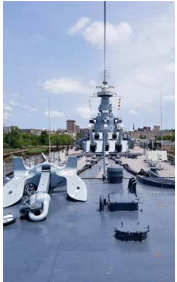
(above) The actual battleship North Carolina which is hosting us next month.