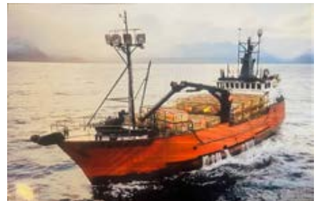
(below) Jim's stunning 12'+ U-140 photographed at the Hatteras maritime Museum.