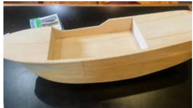
(above) Jim Brode is building the "Seabrook", a fishing boat featured in TV. This was inspired, partly, by pictures supplied such as below.