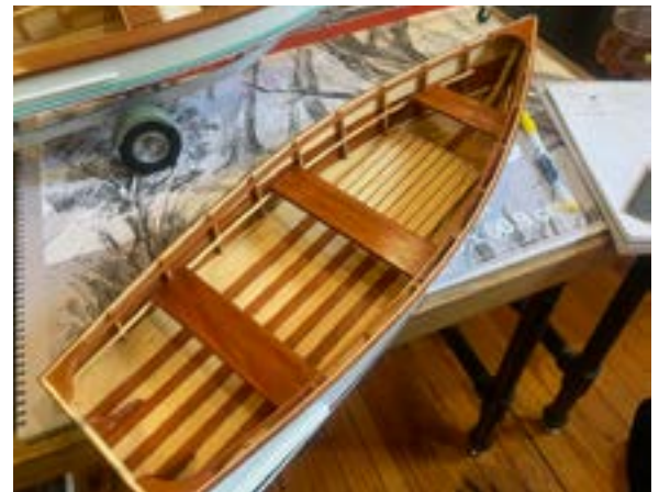
(above) More Mike Hooper boats, with fully detailed interior.