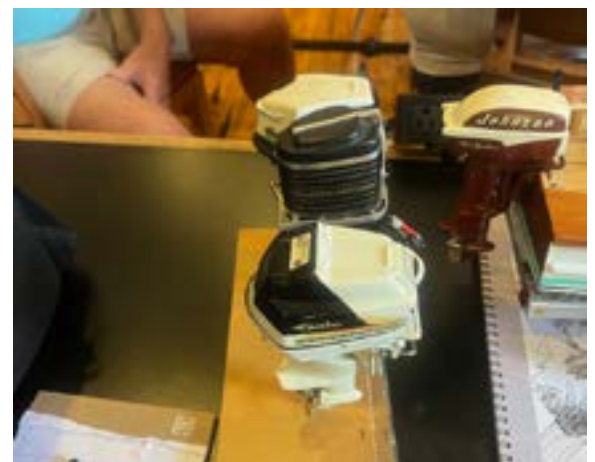
(below) Model outboards provided by Denny Cole, all scratch built.