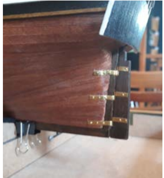
Close up of the stern post and rudder detail. Details like this can turn heads as well as the vessel itself.

A reminder also that this event is coming up and in addition to all of us enjoying this fine production we, as a club, will also be participating and promoting ourselves to prospective new member Let us make the most of this opportunity to recruit new members.